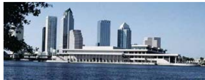
Sections Congress 2005 is coming to Tampa!

Institute of Electrical and Electronics Engineers, Inc. Florida West Coast Section 3133 W. Paris Tampa, Florida 33614