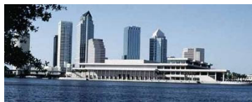
Florida West Coast Section, Tampa

Institute of Electrical and Electronics Engineers, Inc. Florida West Coast Section 3133 W. Paris Tampa, Florida 33614