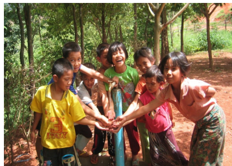
Banquet Keynote Speaker

Be sure to show up early to enjoy networking and our vendor’s booths in the Reception area!