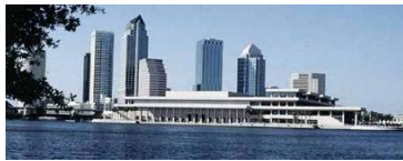
Florida West Coast Section, Tampa

Institute of Electrical and Electronics Engineers, Inc. Florida West Coast Section 3133 W. Paris Tampa, Florida 33614