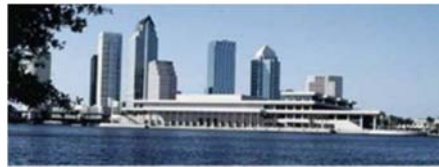
Florida West Coast Section, Tampa

NON PROFIT ORG U.S. POSTAGE PAID TAMPA, FL. PERMIT No. 1197