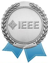
2019 Outstanding Section Membership Recruitment Performance Daytona Section

Thursday March 26th at the Halifax River Yacht Club 331 South Beach Street, Daytona Beach, Florida 32114