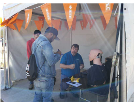
Atlanta March 2019

MOVE was at the Atlanta Science Festival where over 25,000 people saw the truck. The truck provided tours and supported internet for the IEEE staff and the public. It was a great working with the Atlanta section who provided many hands-on activities for the students in addition to the MOVE truck.