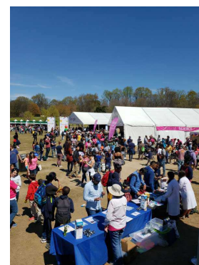
Atlanta March 2019