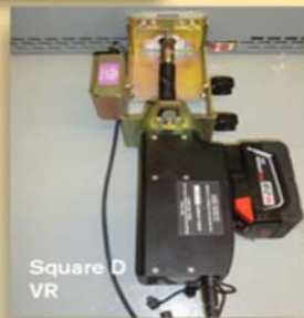
Square D VR