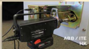
ABB / ITE HK