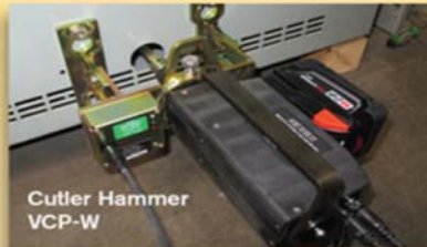
Cutler Hammer VCP-W

Choose the Only Fully Automated, Portable & Scalable Remote Racking System